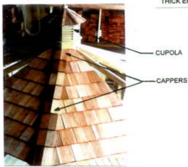
FIGURE 25: CAPPERS & CUPOLA