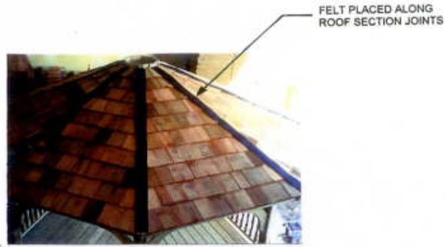
FIGURE 23: ROOF FELT LOCATION